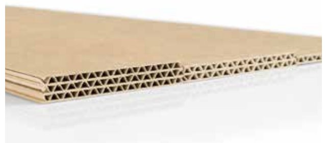
The ECT sample saw cuts samples up to 20 mm thickness