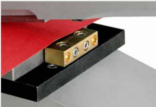
The material to be punched is placed on the lower blade

The material to be punched is placed against the rest on the lower blade. When the hand lever is pushed down, the sample is evenly cut and falls through the die below the punch, where it can then be removed from the side.