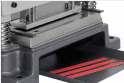
Metal sheet for easy removing of the samples